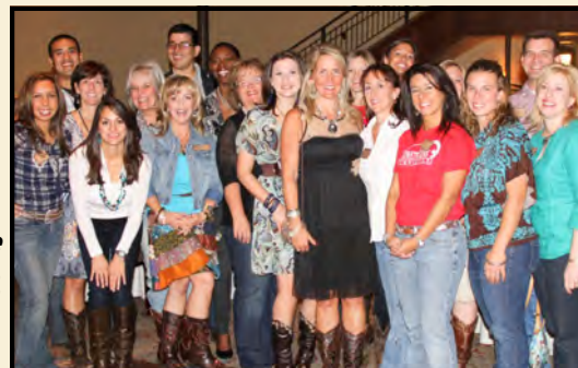
A huge thank you to Kinetic Kids’ hardworking Hoot committee for another successful event!