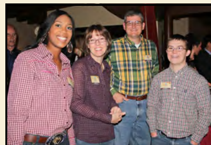
Hootenanny guests enjoying the festivities.

All proceeds from Hootenanny directly support sports and recreational programs for children with special needs. On behalf of the Ki-