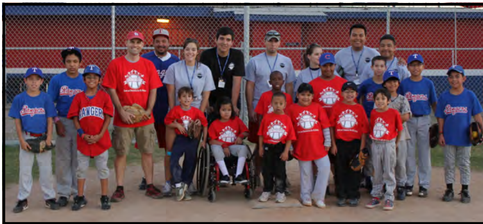
Kinetic Kids Fall 2011 Southside Baseball team & volunteers with the 5 Diamond Little League Rangers.